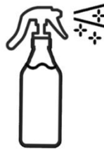
Cleaner is ready to use!